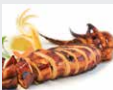
Ika Maru Yaki