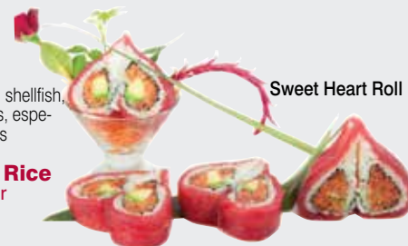
Sweet Heart Roll

* Served Raw Consuming raw or undercooked, seafood, shellfish, may increase your risk of foodborne illness, especially if you have certain medical conditions