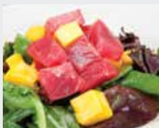
Tuna & Mango Salad