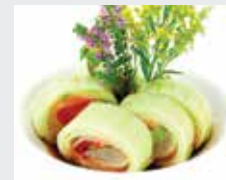
Spicy Crunch Tuna Naruto Roll