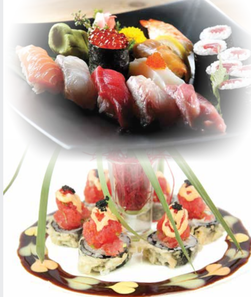
Crispy Spicy Roll