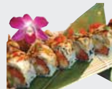
Two Flavor Roll