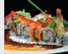
No. 5 Roll